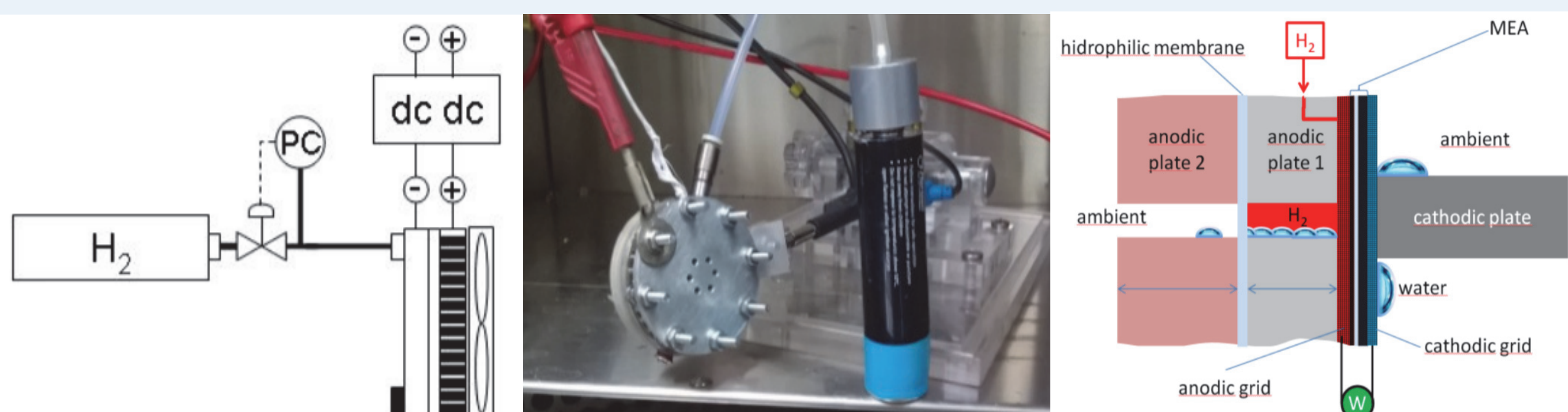
Figure 1. FC scheme and main parts.