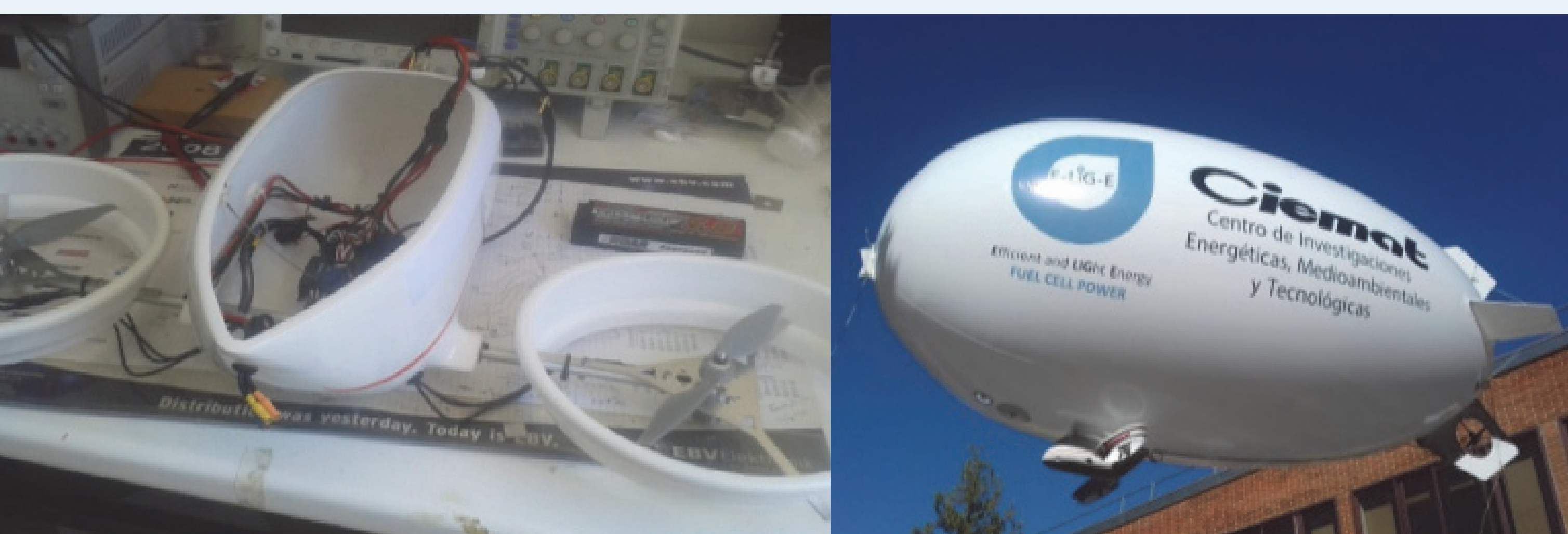
Figure 2. Application in a mini-airship developed in CIEMAT.